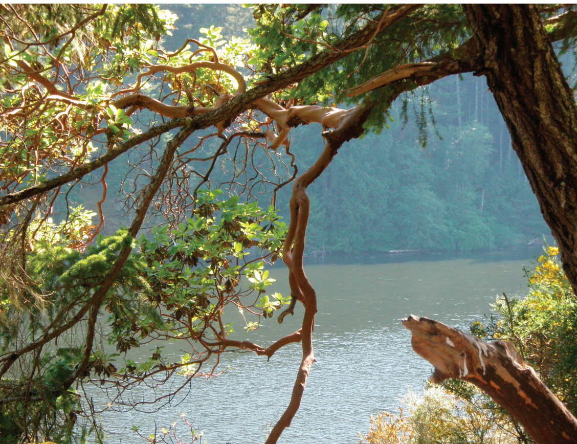
A glimpse of Matheson Lake through the trees on the lakeshore trail.