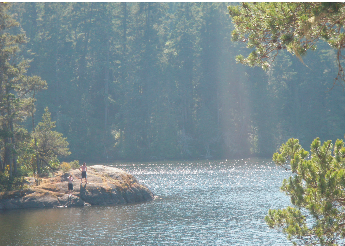
Swimmers on Ian Gillespie Island at Matheson Lake.